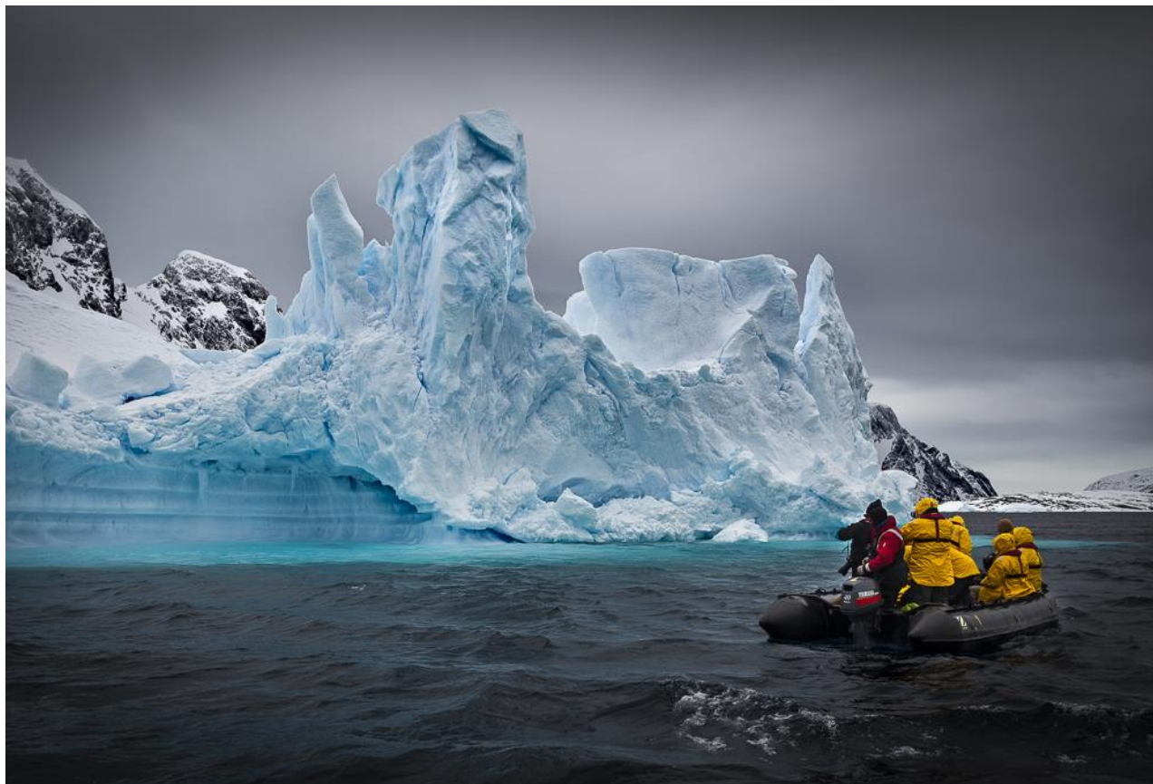
Zodiac Cruising in Antarctica

Passengers on our voyage to Antarctica should be capable of walking up and down the ship's gangway – equivalent to walking up and down a steep set of stairs (at times, the ship may be pitching and rolling), getting in and out of zodiacs with assistance from our staff, making their way across rock surfaces which can be wet and slippery at times, and walking on snow and ice.