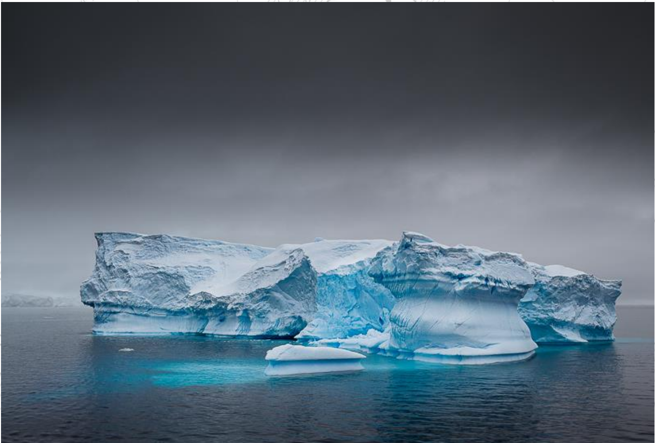
Ice Sanctuary Wilhelmina Bay Antarctica