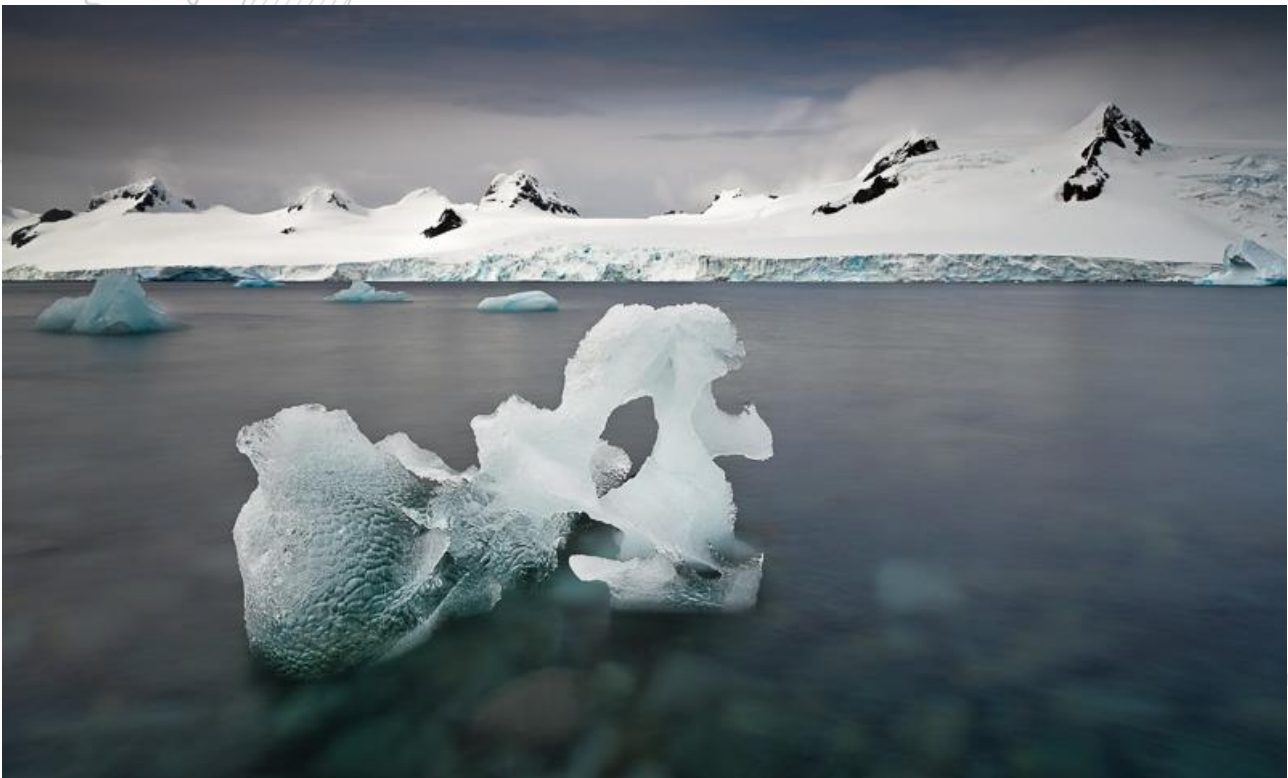
Green Ice and Pebbles Antarctica

Please contact me via email at antony@antonywatson.com if you would like a booking and reservation form.